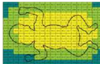
Leading US-based competitor

American Academy of Pediatrics (AAP) intensive phototherapy standard: ≥30μW/cm 2 /nm